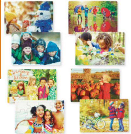
This resource supports the Seasons Puzzle Set Item #BSS191619

Talking about the seasons never gets old! Or so we hope. We do it in our classrooms year after year and it behooves us to keep it fresh and interesting. Here are some key concepts about the seasons and suggested talking points for each puzzle.