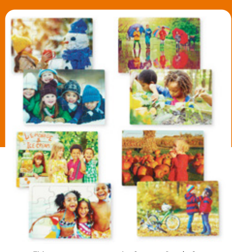
This resource supports the Seasons Puzzle Set Item #BSS191619

Talking about the seasons never gets old! Or so we hope. We do it in our classrooms year after year and it behooves us to keep it fresh and interesting. Here are some key concepts about the seasons and suggested talking points for each puzzle.