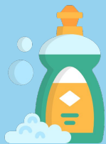
\frac{1}{2} cup Dish Soap