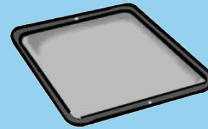
Cookie Sheet (or plate)

Cover your cookie sheet or plate with the baking soda and get ready for some super science!